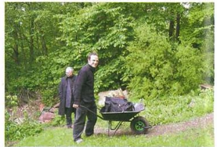
11:31 wheeling precious cargo of slides uphill