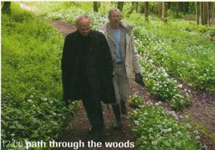
12:00 path through the woods from the house to the car