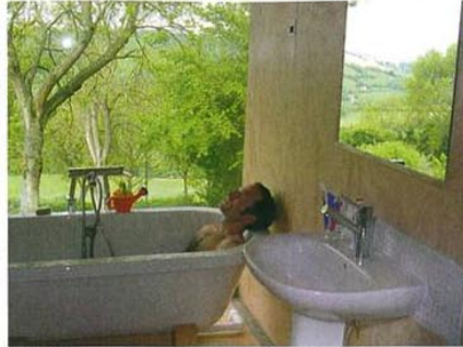
7:30 five minutes of peace