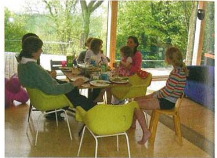
8:15 breakfast time