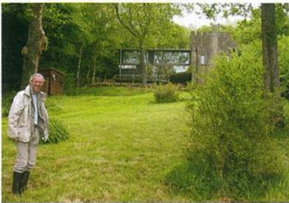
11:00 showing meredith my house

Having Glenn Murcutt to stay is a breeze, Piers Taylor discovers, when you have your own house in the wilds to show off