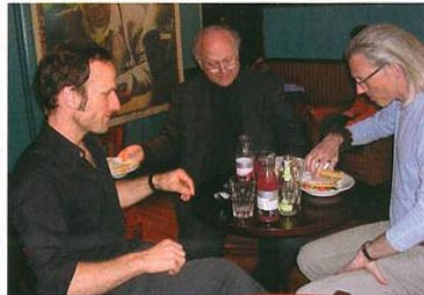
12:30 early lunch in bath