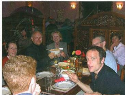
19:00 dinner afterwards