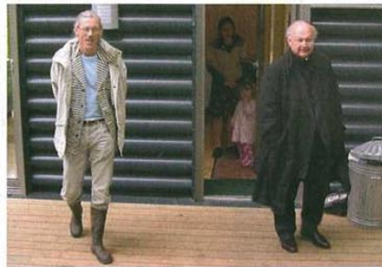
11:30 leaving for bath